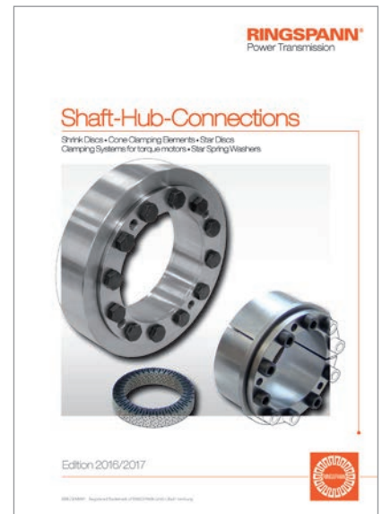
The new 2016/17 product catalogue provides a complete overview of the current and extended RINGSPANN range of two and three-part shrink discs and cone clamping elements as well as star discs, torque motor clamping systems and star spring washers.

So that a motor shaft or a drive shaft can pass on its rotational force without any loss, it needs a secure and firm connection to the hub or shaft of the moved machine element. For this purpose, manufacturer RINGSPANN produces a large range of frictional shaft-hub-connections which, depending on execution and version, transfer torques and axial forces as well as lateral forces and bending moments. The newly presented 2016/2017 product catalogue now provides a complete overview of the current and extended portfolio of two and three-part shrink discs, cone clamping elements as well as star discs, special torque motor clamping systems and star spring washers for ball bearing compensation. On over 80 pages, all shaft-hub-connections are practically and very clearly described with colour images, technical drawings, data tables and short texts. In the catalogue, RINGSPANN also presents its innovative online calculation tool, which enables design engineers, product developers and purchasers to perform an individual and highly precise dimensioning of the optimal shaft-hub-connection.