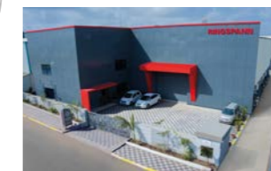
RINGSPANN Power Transmission India Pvt. Ltd., India