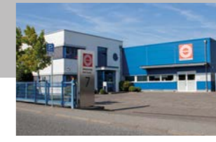
RINGSPANN RCS GmbH, Germany Plant Remote Control Systems