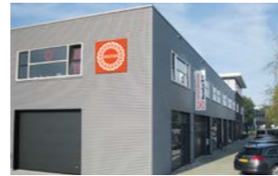
RINGSPANN Benelux B.V., Netherlands