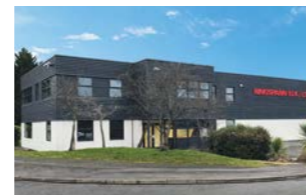
RINGSPANN (U.K.) LTD., Great Britain