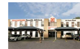
RINGSPANN South Africa (Pty) Ltd., South Africa