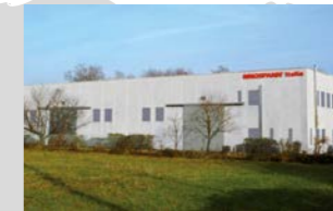
RINGSPANN Italia S.r.l., Italy