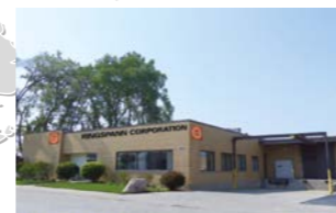
RINGSPANN CORPORATION, USA