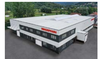
RINGSPANN Bosanska Krupa d.o.o., Bosnia and Herzegovina