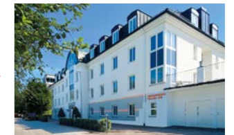
RINGSPANN Nordic AB, Sweden