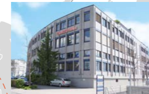
RINGSPANN AG, Switzerland