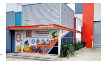
RINGSPANN Australia Pty Ltd, Australia