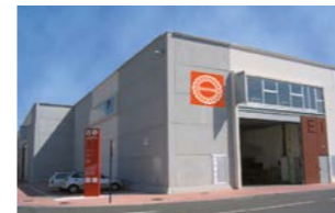
RINGSPANN IBERICA S.A., Spain