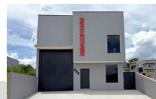
RINGSPANN do Brasil Ltda., Brazil