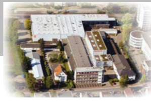
RINGSPANN GmbH, Germany Headquarters and Plant Freewheels

Power Transmission Clamping Fixtures Remote Control Systems